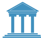
U.S. Government Representatives